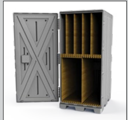
(Interior options not included)